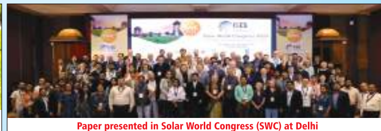
Paper presented in Solar World Congress (SWC) at Delhi