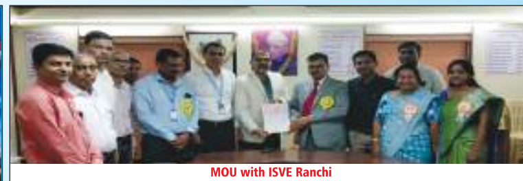
MOU with ISVE Ranchi