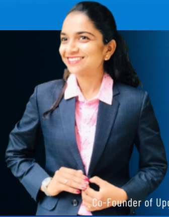
Co-Founder of Upgrade India